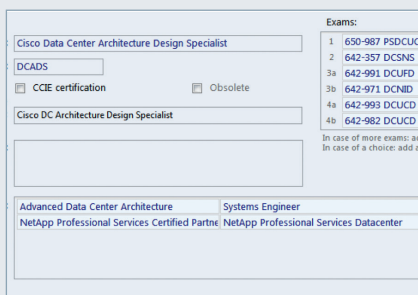
All certifications, specialisations and tests

Certifications amongst your employees will expire at different times so continuous monitoring is necessary, this is where Certi Tool comes into play. We can identify when each member of your team will require to sit their exam in order to renew their certification, so you are compliant with your partner specifications. We can then highlight if a course is required before sitting the exam and when the training is available. Certi Tool keeps on top of any changes implemented to the partnership requirements, keeping you up to date with all the latest obligations and specifications. We can also help you plan in advance to ensure you are fully covered should any certified employee leave your company.